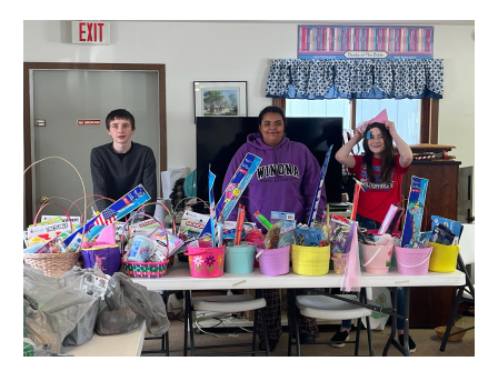
FAITH FAMILY GAME NIGHT WAS A GREAT TIME!

OUR FAITH FAMILY YOUTH GROUP KIDS HELPED PACK 75 EASTER BASKETS AND 120 BAGS OF CANDY.